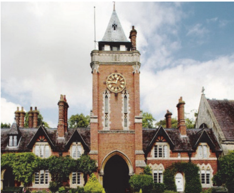
Beauchamp Community, Malvern

23 September saw a visit to the Beauchamp Community where our group was led into a spacious quadrangle to see the elegant Victorian almshouses which were dedicated in 1864 as homes for the retired workers from the Madresfield estate and