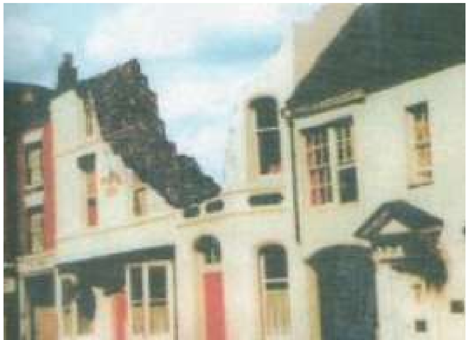
Brandy Cask damage

some brought by the audience at the April meeting. Mustn't forget to send him a card for his 90th birthday in August!