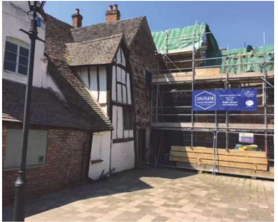
31 High Street undergoing renovation