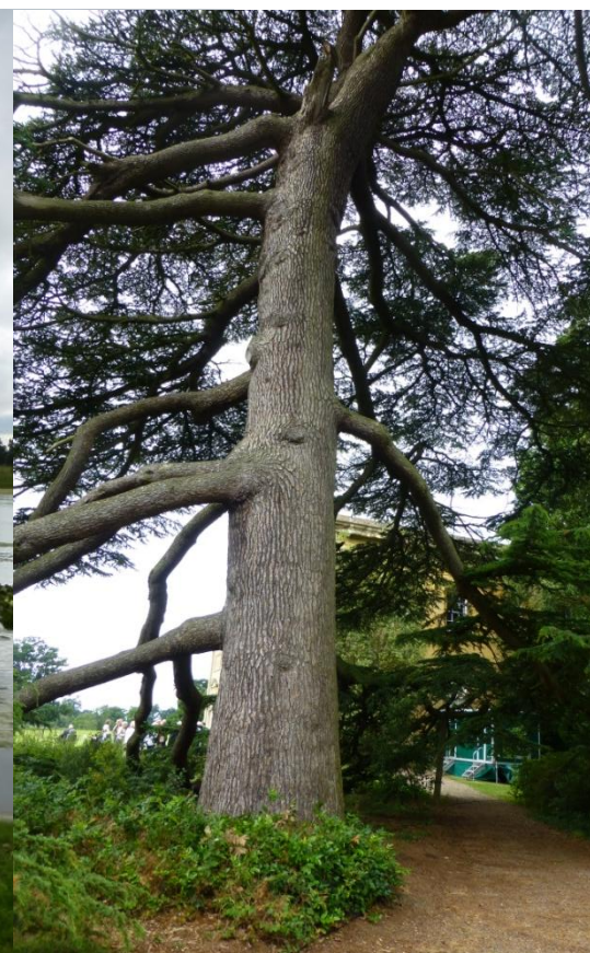
Photos from Spetchley Park Gardens